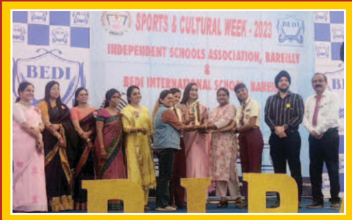
Champion Trophy In Sahodaya Inter School Debate Competition 2023