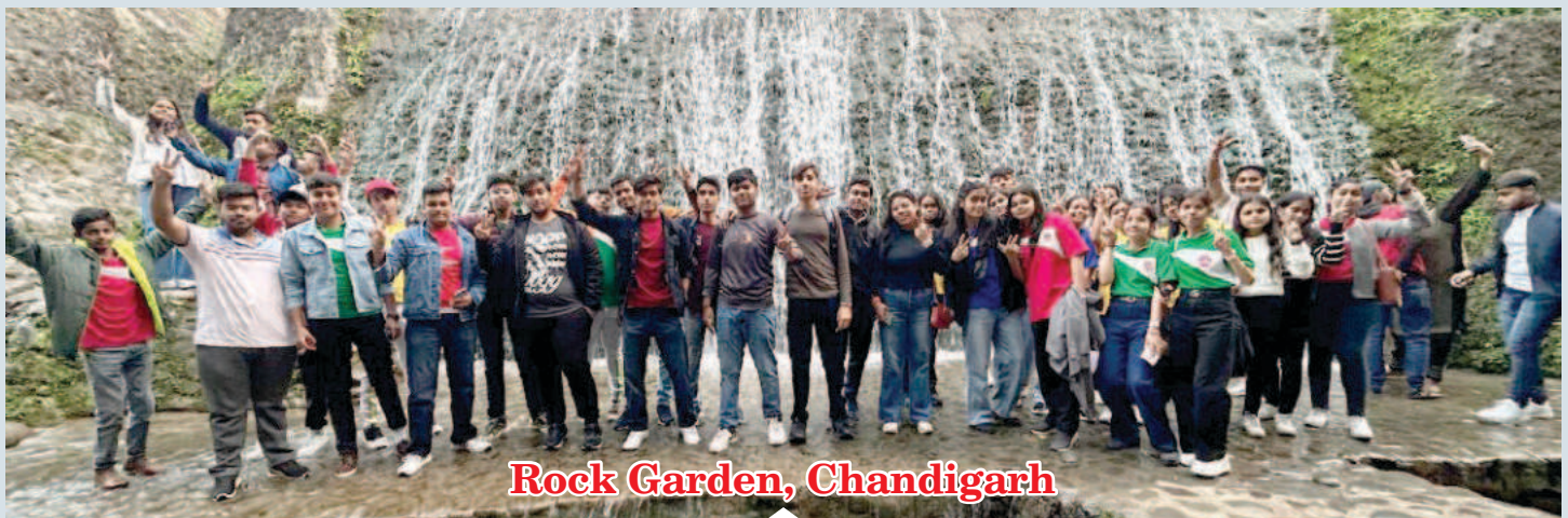
Rock Garden, Chandigarh