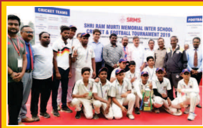
Champion Trophy in Inter School Cricket Tournament- 2019