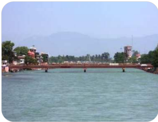
Ganga Color ●