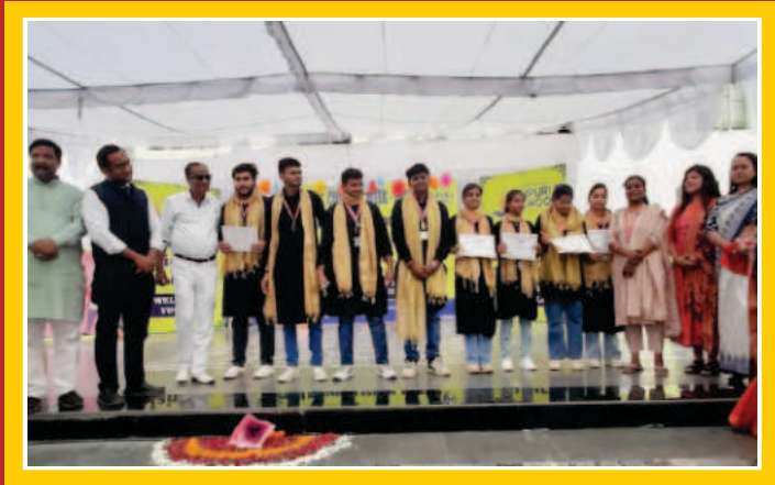
Champion Trophy in Sahodaya Inter School Nukkad Natak Competition 2023