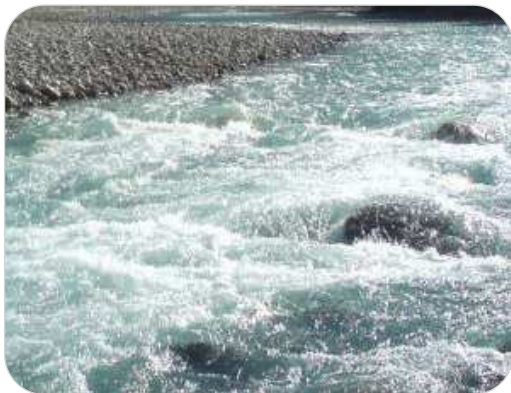
Saraswati Color ●