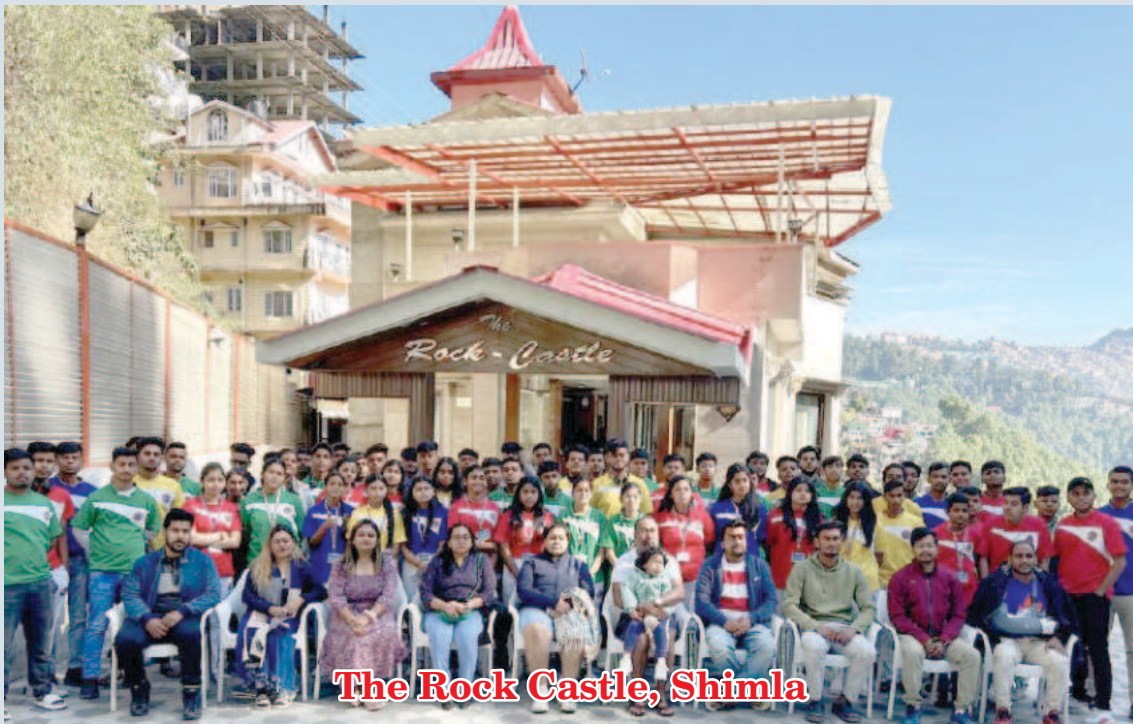
The Rock Castle, Shimla