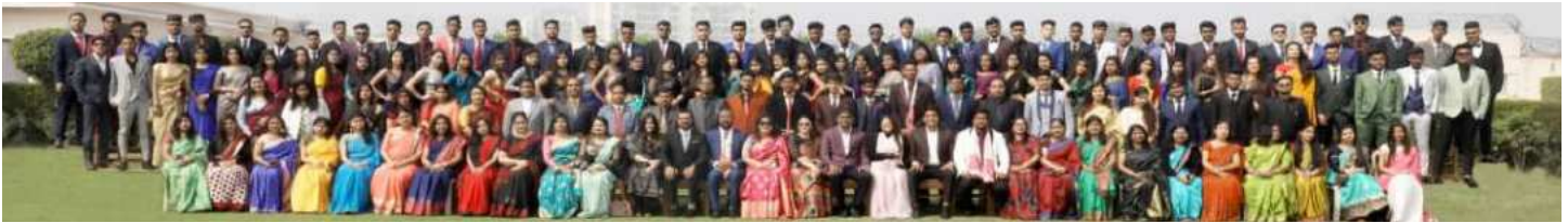
FAREWELL OF CLASS XII (2020-2021)

Co-Educational Sr. Sec. School Affiliated to C.B.S.E., New Delhi