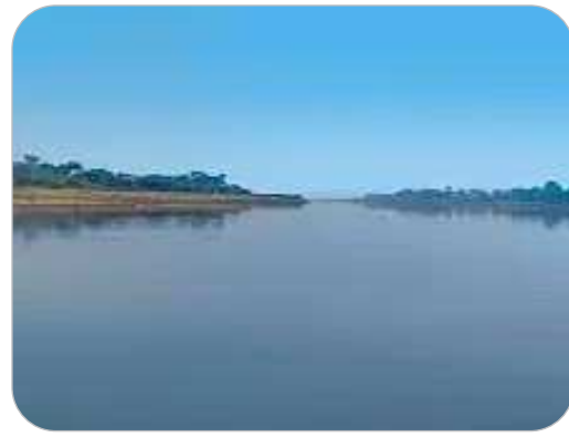
Yamuna Color ●