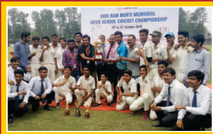
Runner-up Trophy in Inter School Cricket Tournament 2018