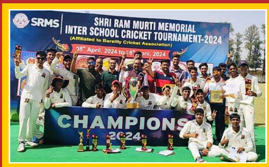
Champion Trophy in Shri Ram Murti Inter School Cricket Tournament- 2024