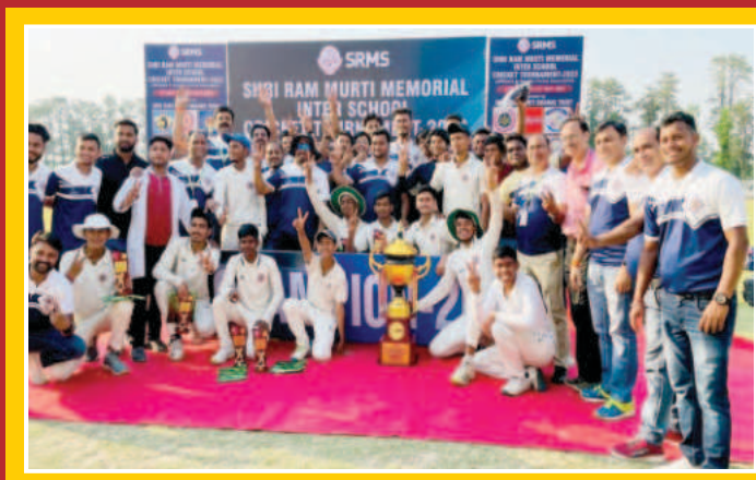
Champion Trophy in Inter School Cricket Tournament- 2023