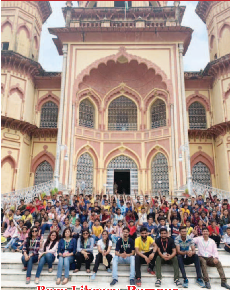
Raza Library, Rampur

"The real voyage of Discovery consists not in seeking new lands but copes in having new eyes; with this objective Educational tours and Trekking are held at least once a year during Summer Vacations and winter vacations."