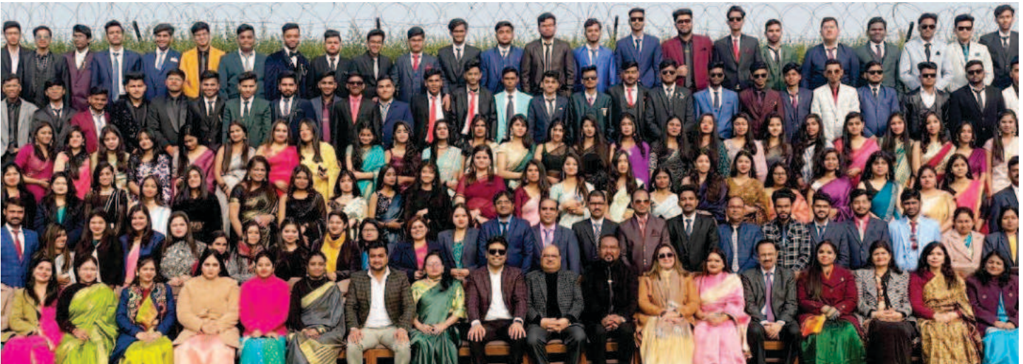
FAREWELL OF CLASS XII (2022-2023)