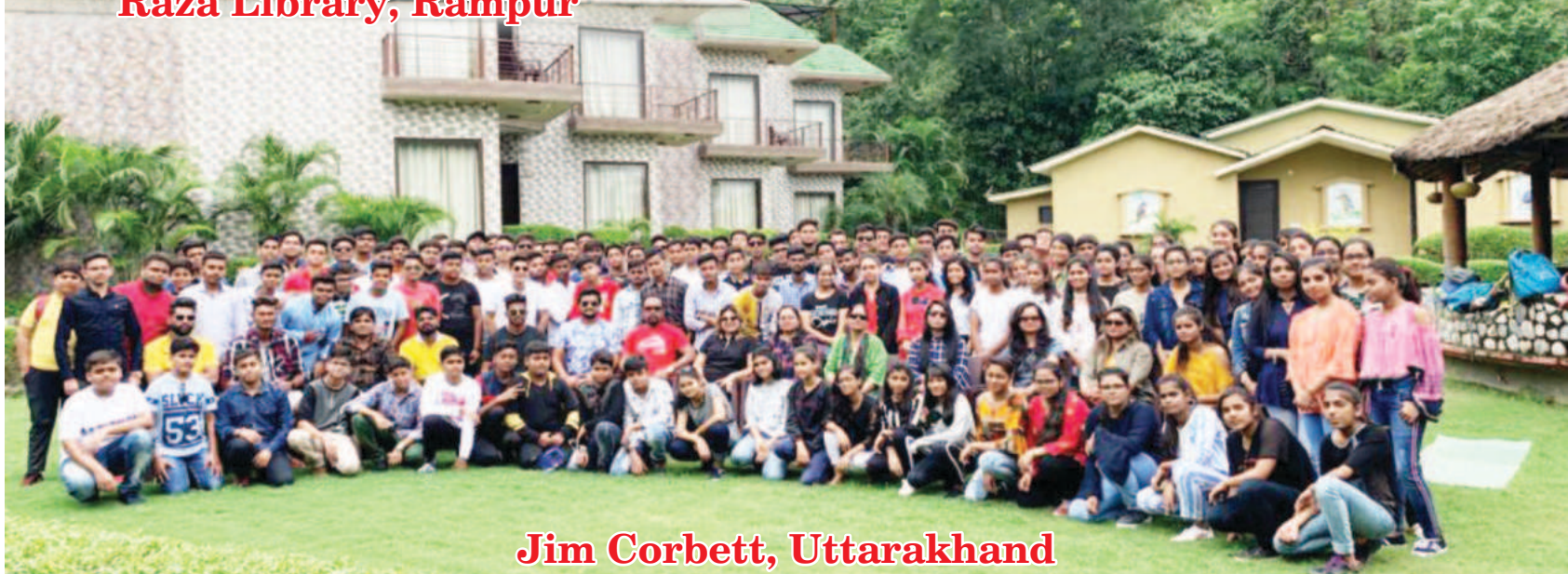
Jim Corbett, Uttarakhand