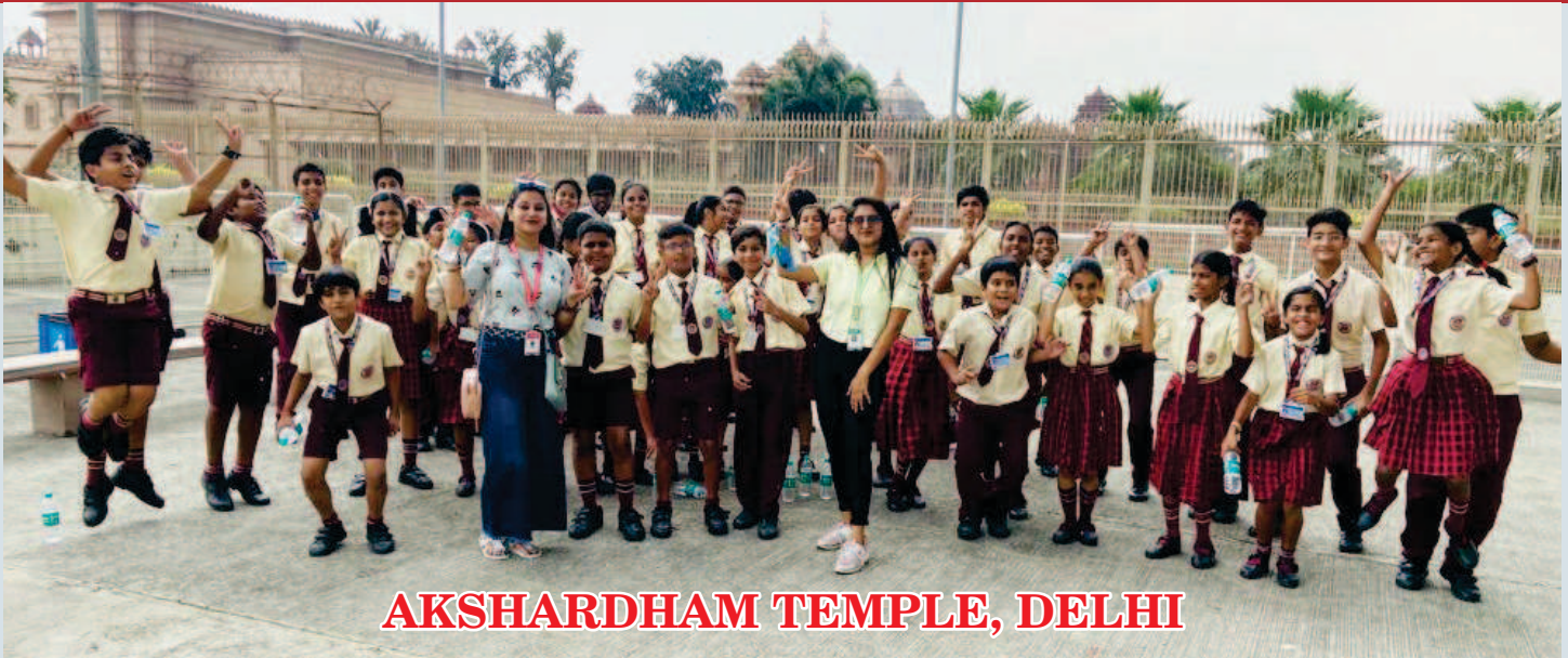
AKSHARDHAM TEMPLE, DELHI