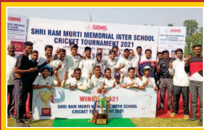
Champion Trophy in Inter School Cricket Tournament 2021