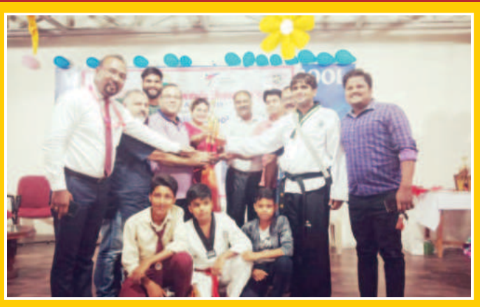
Champion Trophy in Inter District Taekwondo Competition 2019