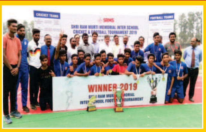
Champion Trophy in Inter School Football Tournament 2019