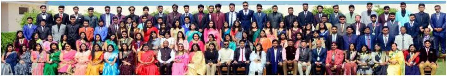
FAREWELL OF CLASS XII (2021-2022)