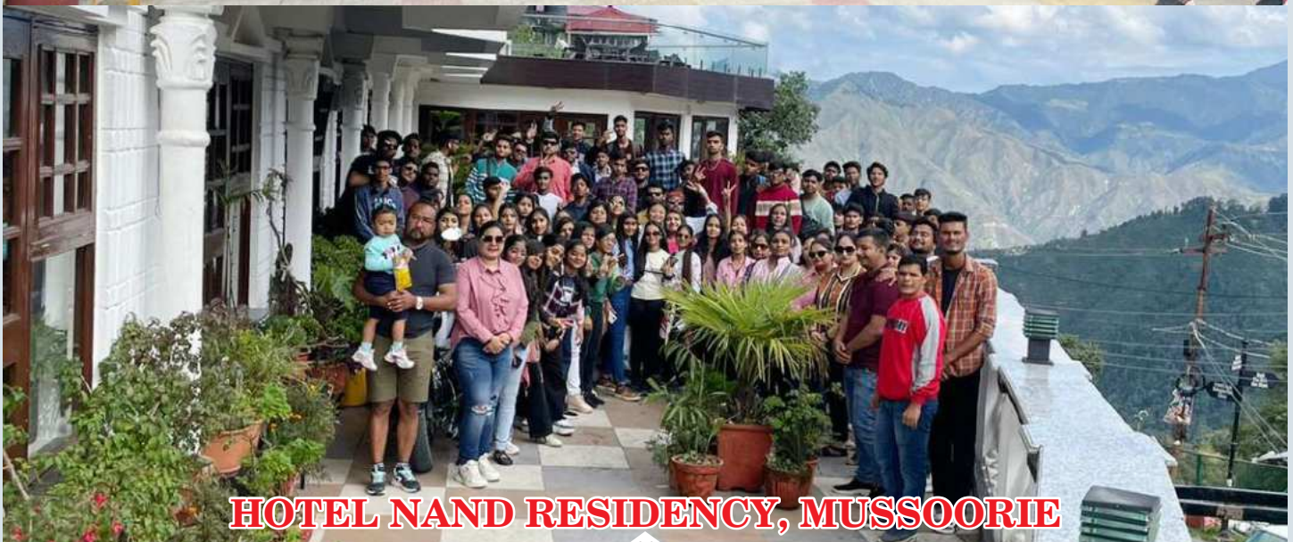
HOTEL NAND RESIDENCY, MUSSOORIE