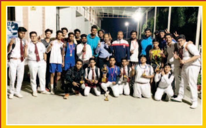
Trophy in Inter School Volleyball Tournament 2018