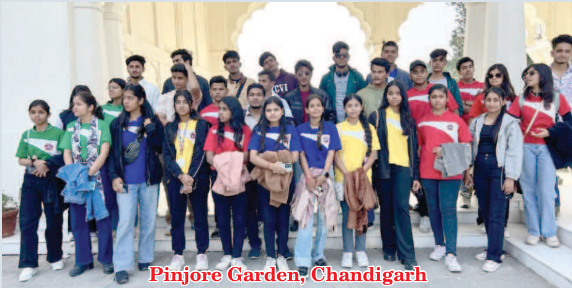
Pinjore Garden, Chandigarh