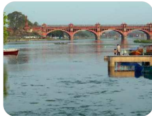
Gomti Color ●