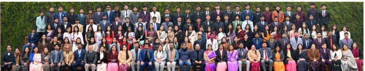
FAREWELL OF CLASS XII (2023-2024)