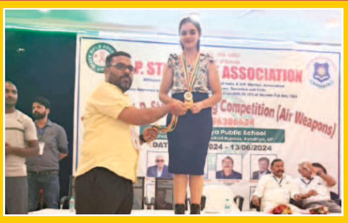
Gold Medal in Inter State Shooting Championship 2024