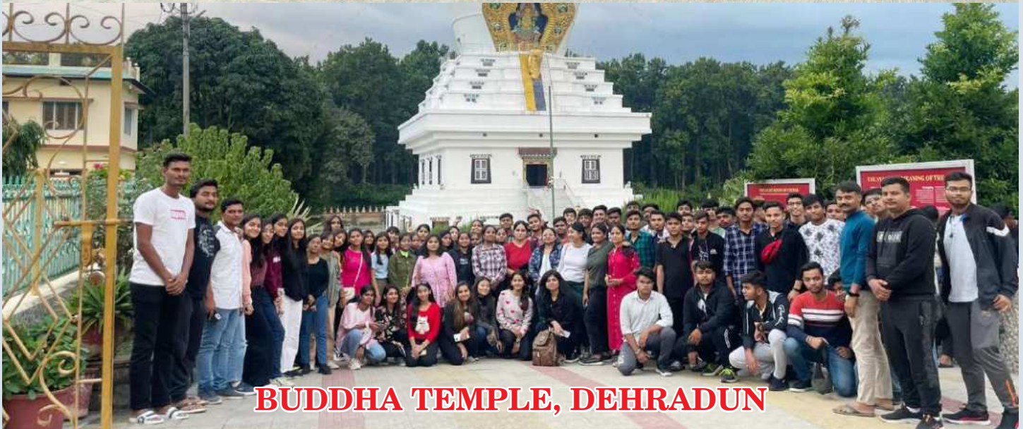
BUDDHA TEMPLE, DEHRADUN